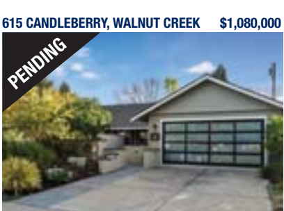
JON WOOD PROPERTIES